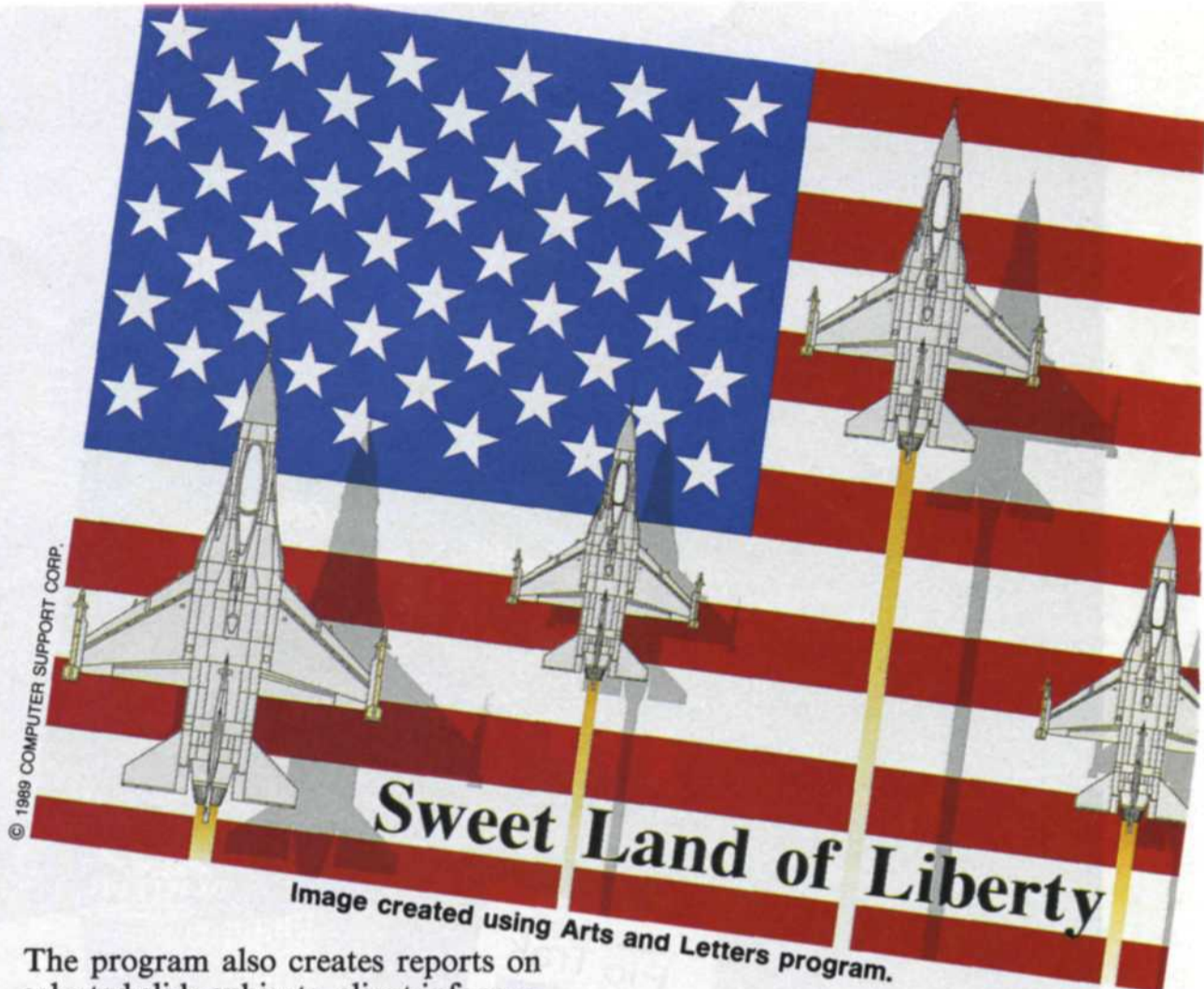
Image created using Arts and Letters program.

PHOTOTRAK is designed for the more advanced stock photographer who has accumulated thousands upon thousands of images, and needs an extensive program that will document every aspect of their filing system. The program includes a slide-label menu that allows you to view the labels on the screen, and then print them on a dot-matrix or laser printer.