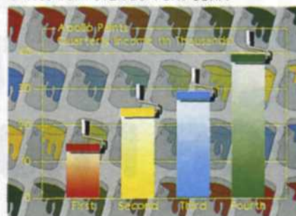
Sample image, Arts and Letters.