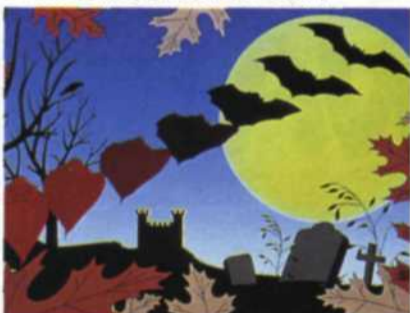
Blend image, Arts and Letters.