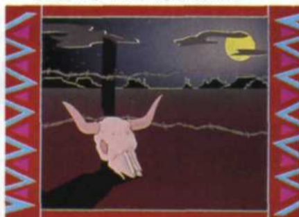
Clip-art image, Arts and Letters.