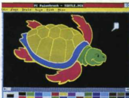
Trans image, Freedom of Press program.