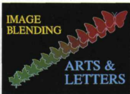
Blend image, Arts and Letters.