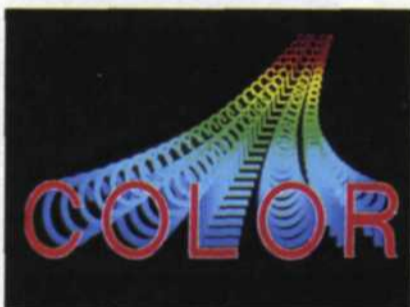
Color sweep image, created using Mirage program.