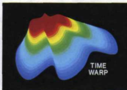
Color sweep image, Mirage program.