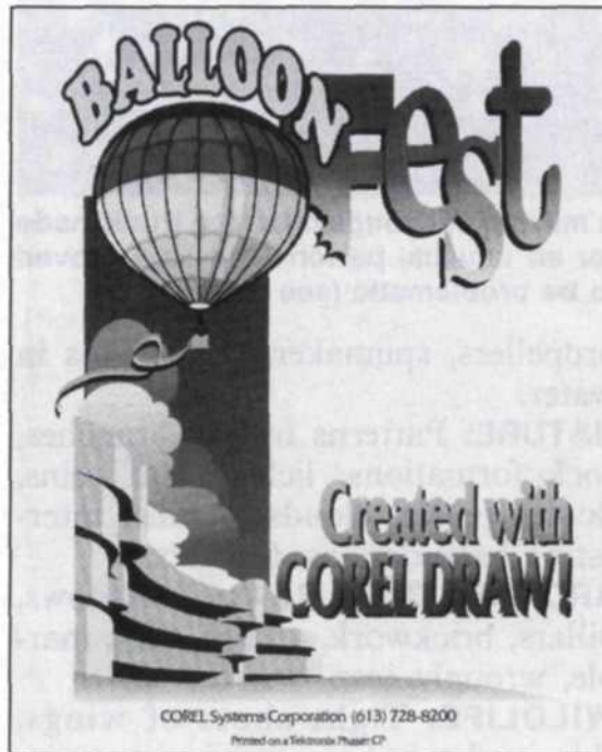
Corel Draw image by Corel Systems. (Original in color.)

or manipulation into new images. Corel Draw uses the Pantone color system for color matching and easy identification. The Pantone color system is also useful for the color separation utility, where the colored images are separated into printing-press separations, ready for making four-color offset plates. Corel Draw operates under the control of another program by Microsoft Corporation