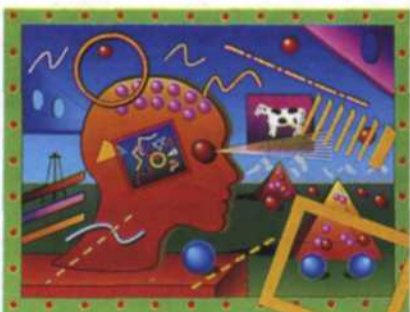
Sample image, Mirage.