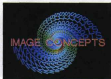
Spin and sweep image, Mirage.