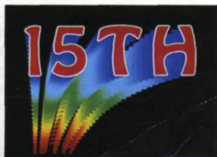
Trans image, Metafile.

ALL COMPUTER GRAPHICS BY AUTHORS WERE IMAGED WITH A LASERGRAPHICS FILM RECORDER, IRVINE, CA.